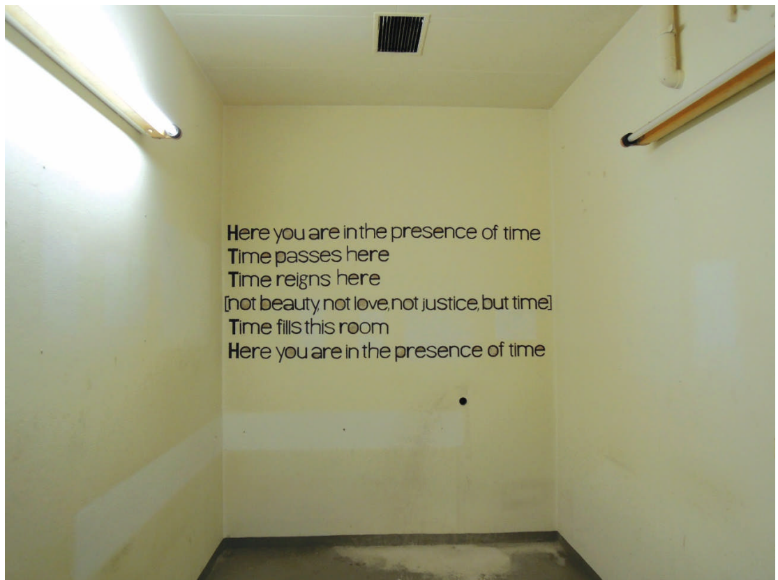
Figure 4. de Melo, M (2012) Time Sculpture , Chemnitz. Photo by the author: Amsterdam.

I am inclined to suggest that time as art practice is an idea mostly propagated by art institutions; both through the use of time as material itself, and through gathered materials which directly connect to the idea of occupying time.