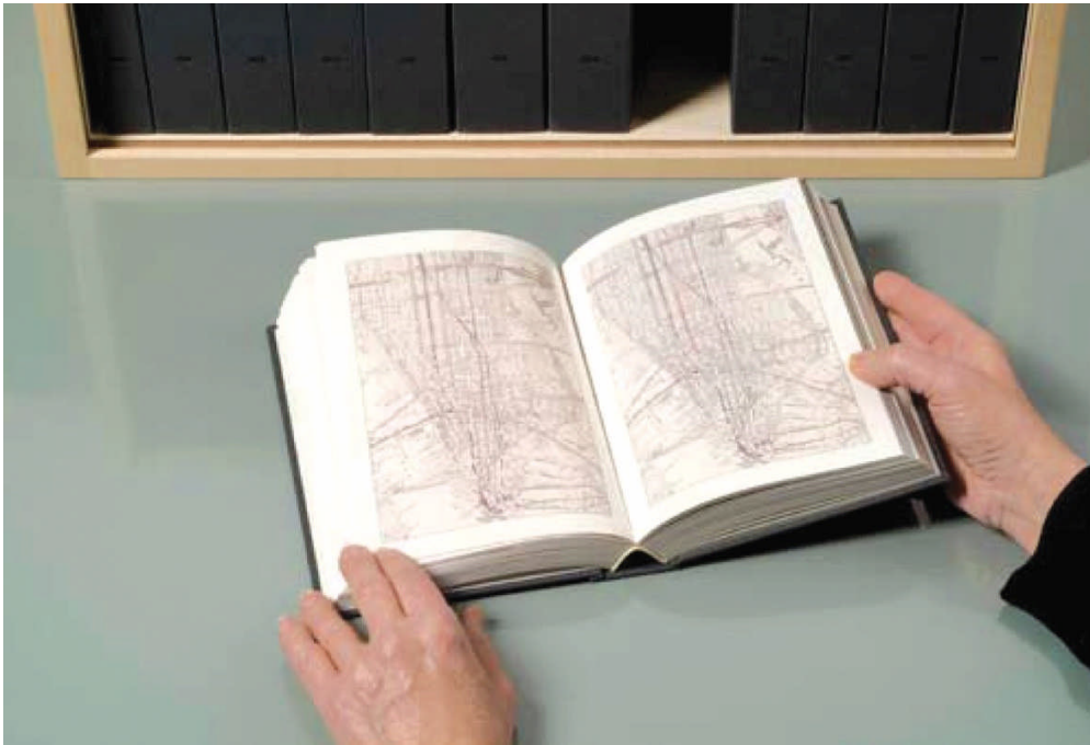
Figure 2. Kawara, O (1968-79) I Went [daily trips traced on photocopied map, 4740 pages, 12 volumes] At: http://www.micheledidier.com/media/catalog/customfield/on_kawara__i_went.pdf (Accessed on 16.07.15).

In parallel with Kawara's practice I have travelled widely, and also worked with postcards that were made from gathered tickets and packaging material from places that I visited and then sent to friends around the world. I have cultivated this practice since 2003, however I was unaware of its relevance and implications until quite recently. These postcards have triggered the production of a large number of small-scale works that I have already mentioned. These works, which ultimately deal with consciousness, are conceptually related with Kawara's practice. The major difference between our processes is that Kawara uses precise measures with regularity, whereas I use aleatory and suggestive measures as I am interested in irregularity and non-linearity. Like Kawara, I am also interested in movement and change as they can also function as 'our awareness of time, an awareness shaped by a sequence of events determined either by ourselves or by external circumstances' (Wilmes, 2000, p.13).