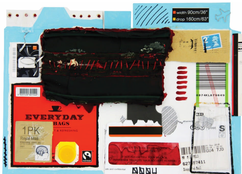
Figure 1. de Melo, M (2010), Daily Bags [collage] Photo by the author: Amsterdam.

I also have issues when it comes to consciousness, art and knowledge production, which play a guiding role in my creative practice. For instance, the act of making things makes me forget the fact that I am a conscious being. It distracts me from the fact that I am alive and have to go through life. It also connects me to something else which I cannot properly figure out. I tend to think that the core of my practice does not necessarily lie in any specific issue, but the passing of time itself—the act of occupying myself with making until something happens or something else more interesting comes up—or even until death comes knocking. All the connections, associations and juxtapositions in my work are mostly intuitive, and I do not always go about consciously deciding what will be used to achieve any predetermined result. Things tend to happen naturally. This is evidenced by the large amount of small scale works that I produce during any given time spent in the studio, works that are made from whatever material I find around me, ranging from coffee cups to discarded paper to leftover paint. Packaging, plastic bits, wrapping paper, tickets, barcodes and certain shapes and shades of colour appeal to me in many ways, and are collected for a possible use. I include them in small scale works that deal with consumption, boredom, mortality, and these smaller works do not necessarily generate pieces on a bigger scale.