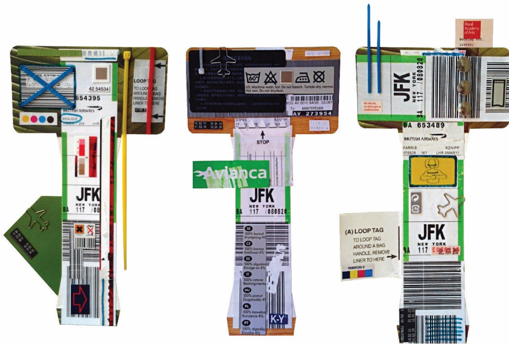
Figure 3. de Melo, M (2010-11) Instances [collage] Amsterdam.