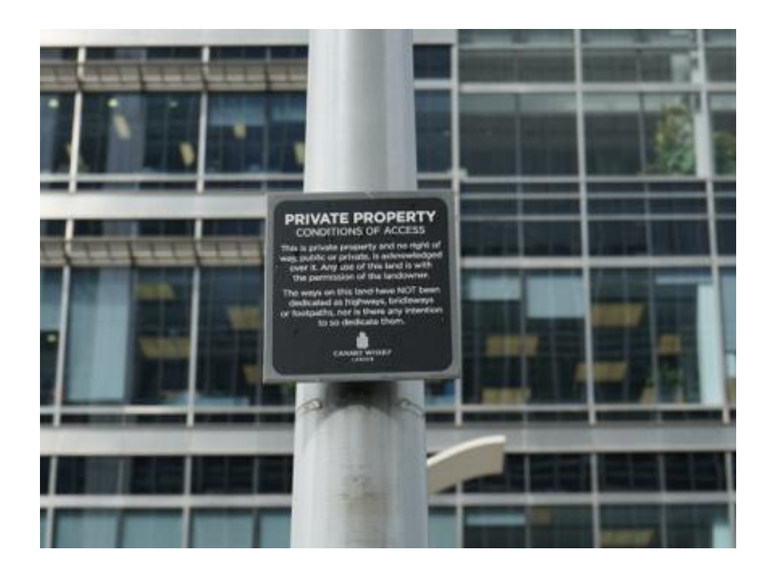
Figure 2: Signage, Montgomery Square