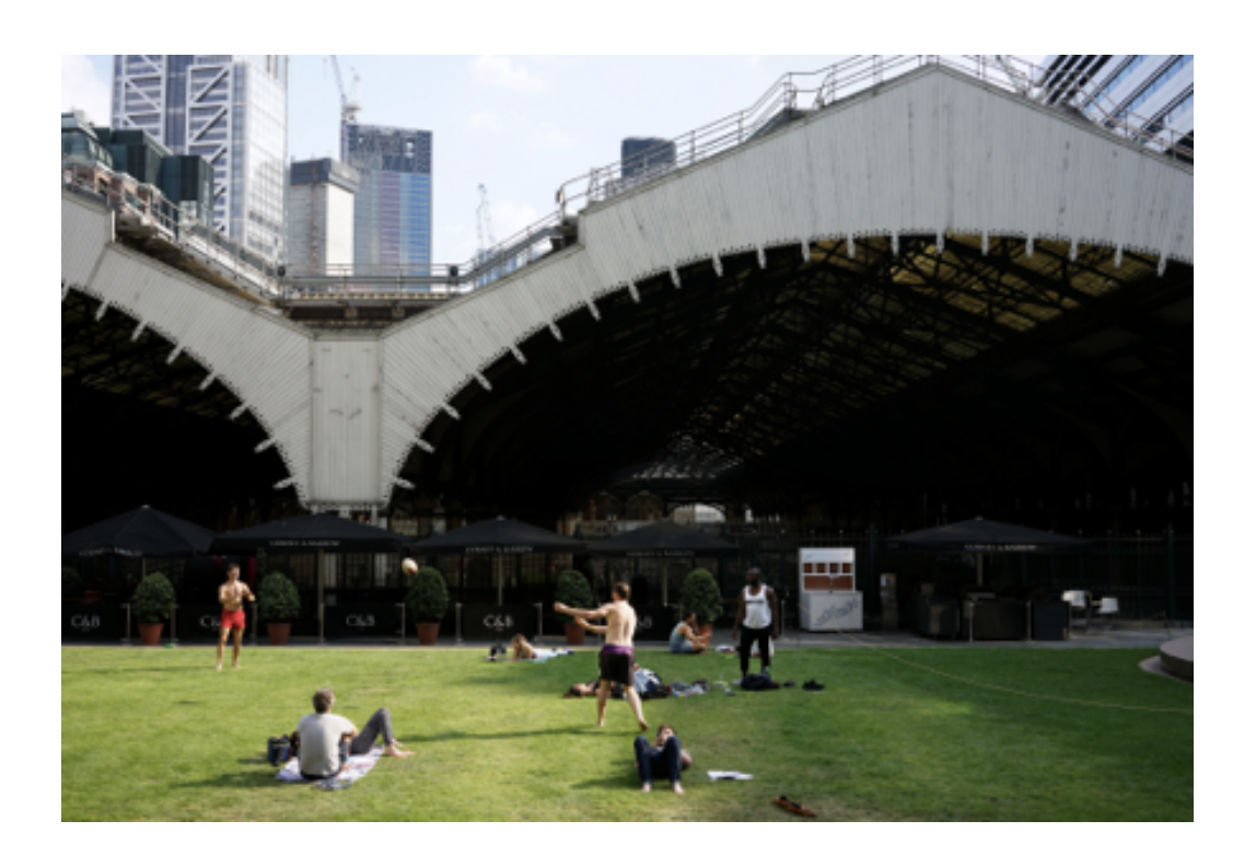
Figure 4: June 2017, Exchange Square

Capitalism has a tendency "to produce space while radically modifying the product" (Lefebvre, 2009: 193). When there is an exchange of money (however worthwhile the cause) spatial dynamics shift as intermediary organisations dictate the rules of participation. The scene in Exchange Square demonstrates the kind of public life produced in cities when space is not micro-managed. It constitutes just one segment of the Square's identity allowed to exist when there is a gap in planning.