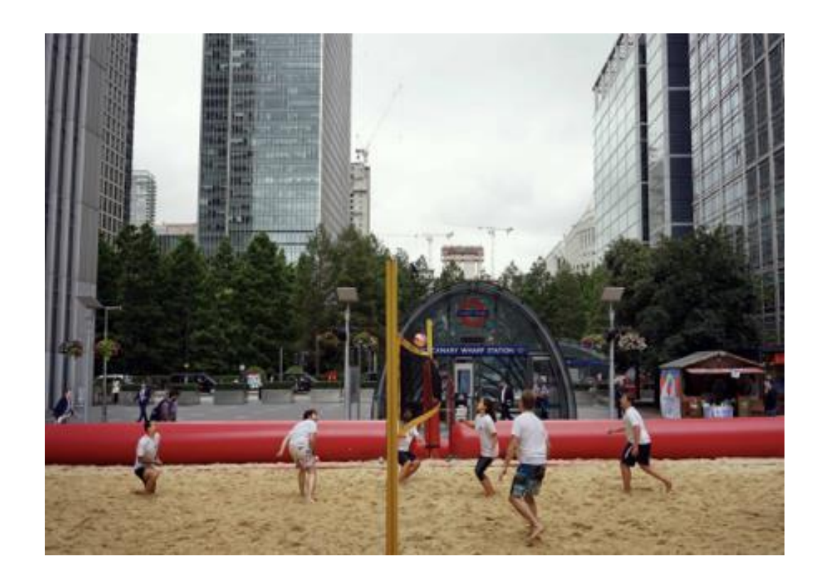
Figure 3: July 2017, Montgomery Square

In Montgomery Square, the activity of play is given a purpose and a framework to support it. The production of profit extends the activity beyond the present. Inhabitants' roles divide: the openness inherent to squares diminishes as private space is established at the centre. By contrast, in Exchange Square, the activity of play does not extend beyond that moment in time, and those not participating in activity enact their own in close proximity.