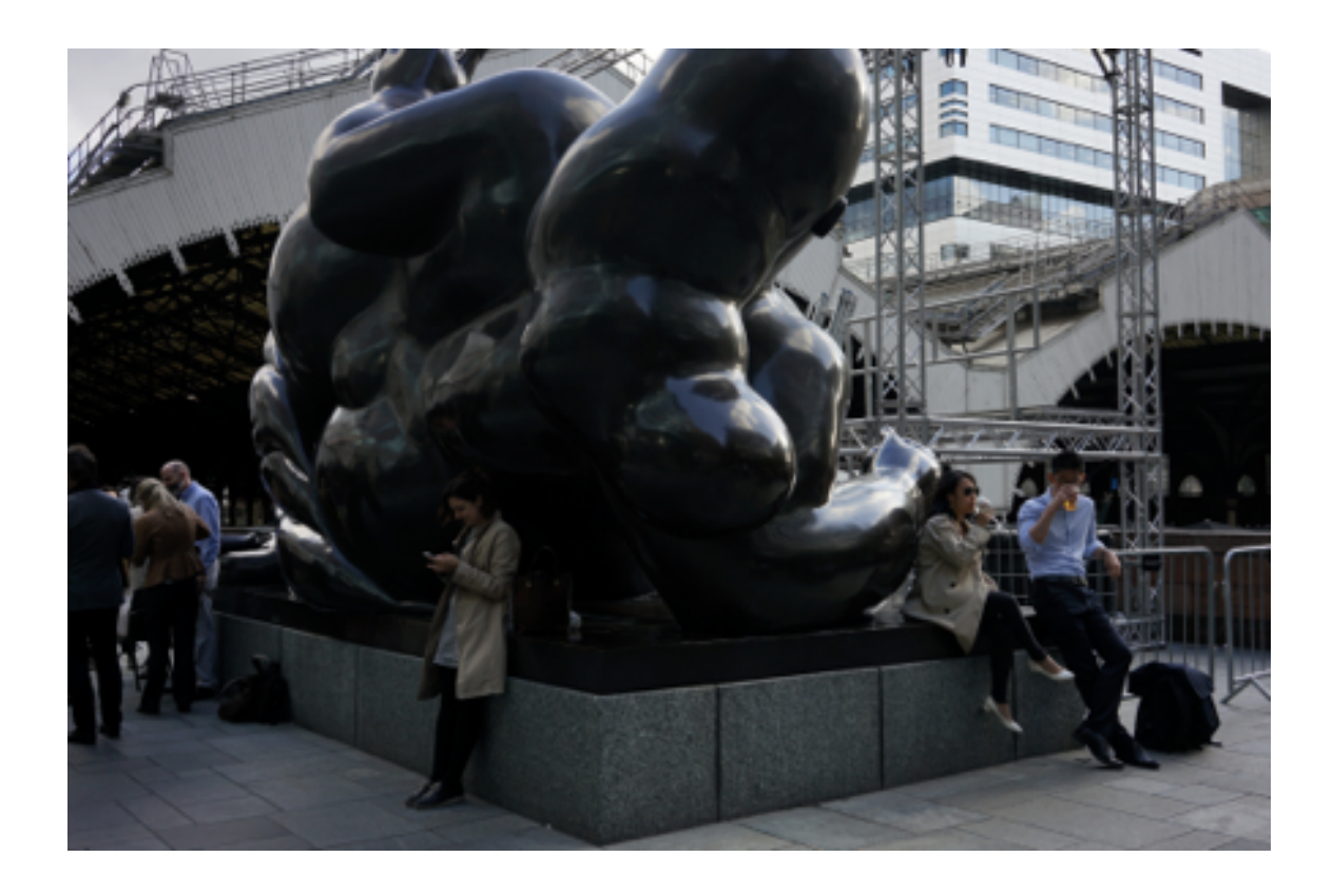
Figure 5: Exchange Square

Corporate structures of ownership prioritise users complicit in the function of the space, the main group being the workers who inhabit their buildings. When this category of user enters the square on their commute or lunch break, the boundary they cross supports their working life. This user inhabits pseudo-public space out of necessity, and the guarantee of their daily inhabitation and associated wealth means their needs are prioritised by management structures. This is demonstrated by the opening hours of Pret A Manger's Regents Place branch: the cafe is only open Monday to Friday (Regents Place, 2017). On Sundays in the Square, I observed families and teenagers trying to gain access, lamenting the fact that despite being surrounded by eateries nowhere is open for them: their occupation is not as valuable to developers because it is not guaranteed with the assurance it will convert to profit. Pseudo-public space reconstructs notions of publicness; intentions revealed through design, policing, organised events and opening times demonstrate a clear separation in publics, and objectives regarding who is welcome to participate, and how participation should be enacted.